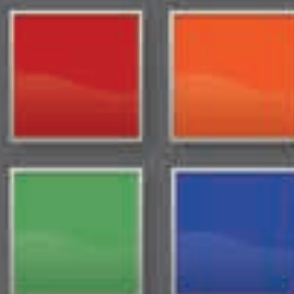
4 Color Options Red, Orange, Green, Blue