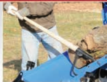
Log Peavey #299001