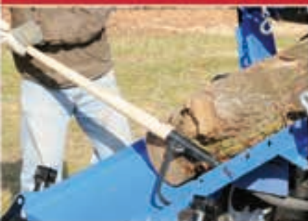
Log Peavey #Z99001