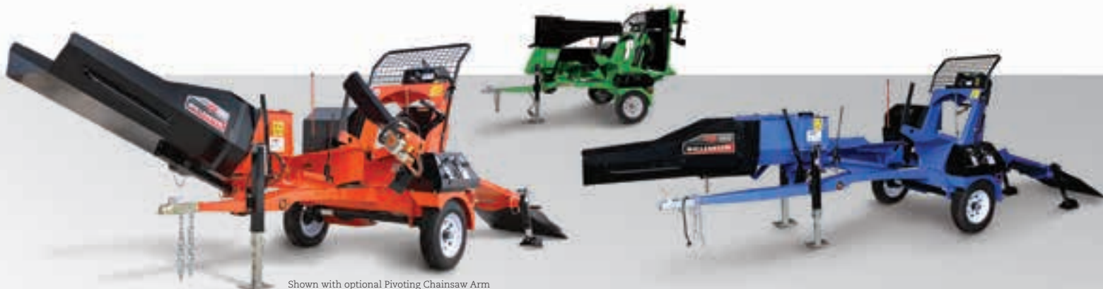
Shown with optional Pivoting Chainsaw Arm