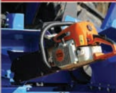
Nylon Chainsaw Holster #P100 (Chainsaw not included)