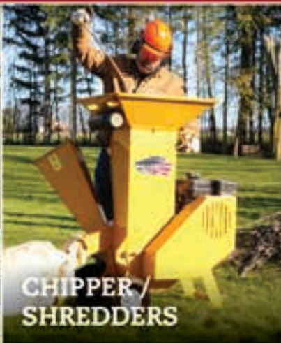
CHIPPER / SHREDDERS