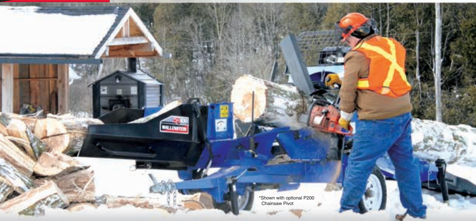
*Shown with optional P200 Chainsaw Pivot