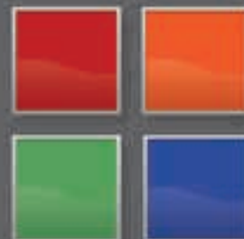
4 Color Options Red, Orange, Green, Blue