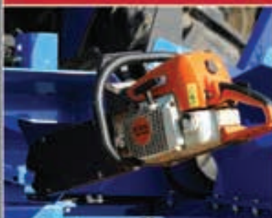
Nylon Chainsaw Holster #P100 (Chainsaw not included)