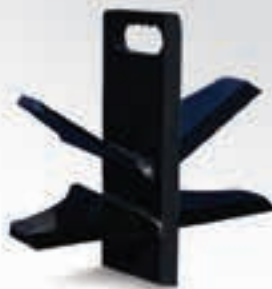
6-Way Wedge #P600