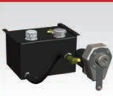
PTO Hydraulic Power Pack #P300