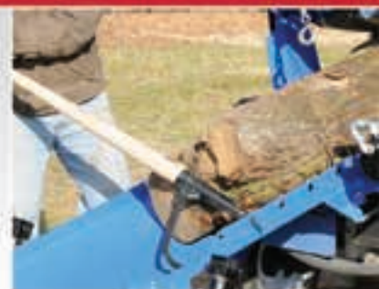
Log Peavey #Z99001