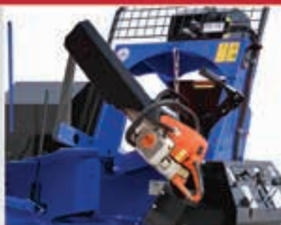
Pivoting Chainsaw Arm #P200 (Chainsaw not included)