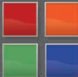
4 Color Options Red, Orange, Green, Blue