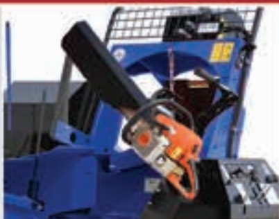
Pivoting Chainsaw Arm #P200 (Chainsaw not included)