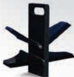
6-Way Wedge #P600