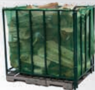
Firewood Bin #P500