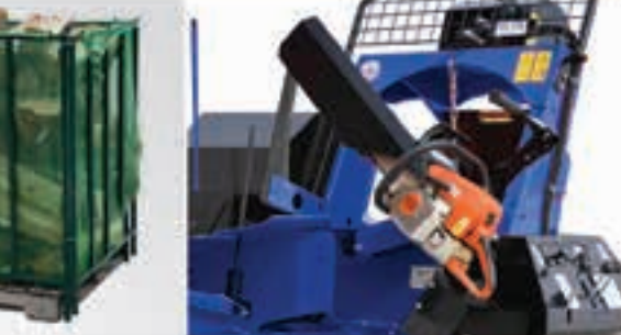
Pivoting Chainsaw Arm #P200 (Chainsaw not included)