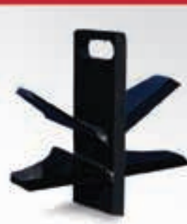
6-Way Wedge #P600