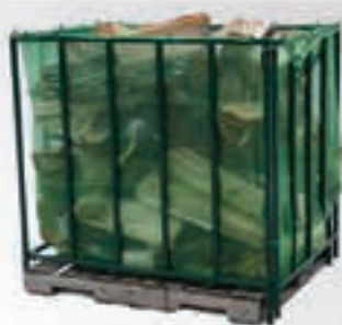
Firewood Bin #P500

Subaru® Electric Start 404 CC Overhead Cam Engine