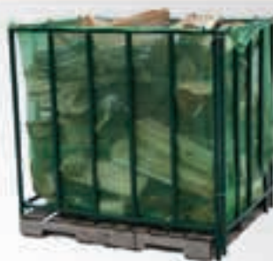
Firewood Bin #P500